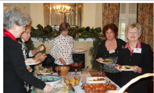
Magnolia Circle's Christmas Lunch

This class series is provided to the Tallahassee Garden Club members through the Health to You (H2U) program at Capital Regional Medical Center. Attendees are required to be a H2U member in order to attend. Not a H2U member? Join for annual membership fee of $20 to take advantage of this series as well as other FREE programs and classes.