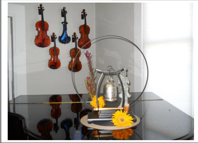
Kyle Dunn (Buddleia) created this Vibratile design which features an element of sound.